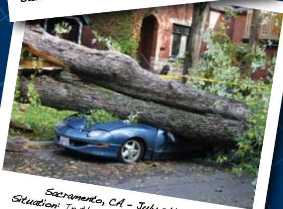
Sacramento, CA - July 8th, 2005 Situation: In the middle of the night, a storm collapsed tree onto vehicle. Owner Owed: $12,815.00 Insurance Paid: $9,000.00