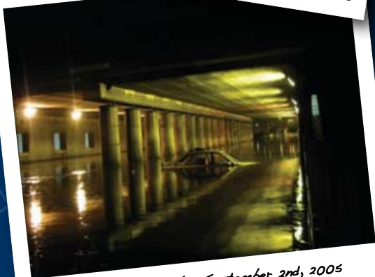
New Orleans, LA - September 2nd, 2005 Situation: Parked car is caught in flood after levy breaks. Owner Owed: $8,631.00 Insurance Paid: $6,500.00