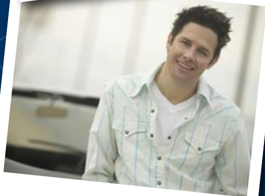
GAP Paid: $2,131.00 New Vehicle Purchased: September 20th, 2005