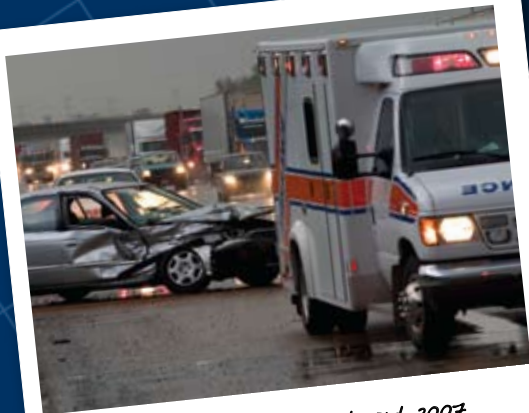
Columbus, OH - March 23rd, 2007 Situation: Vehicle hydroplanes into guardrail during rush hour. Owner Owed: $12,412.00 Insurance Paid: $10,125.00