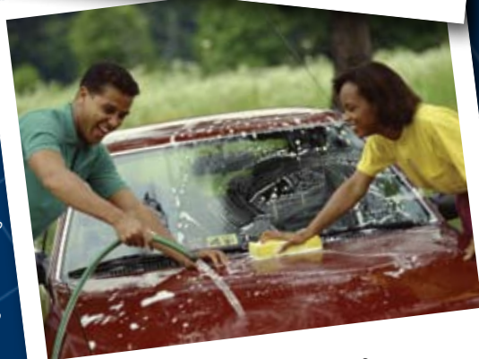
GAP Paid: $3,815.00 New Vehicle Purchased: July 15th, 2005